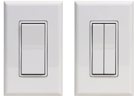
Suitable For Indoor Use Only